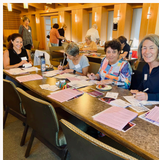
Sending out over 2,000 voter engagement postcards with NCJW!