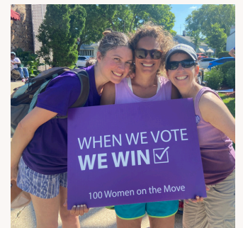
Getting out the Vote with 100 Women on the Move!