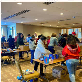
Mitzvah Day at CEEBJ.

It’s been a busy year! From walking to gleaning to canvassing and more, THI has been out and about in the community! Here are just a handful of people we’ve met, places we’ve been, and things we’ve accomplished. You might even see yourself in some of our photos! A huge shoutout to everyone who’s volunteered with us across MKE.