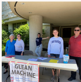
Glean Machine in action!