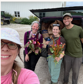
Gleaning with family at Gwenyn Hill Farm.